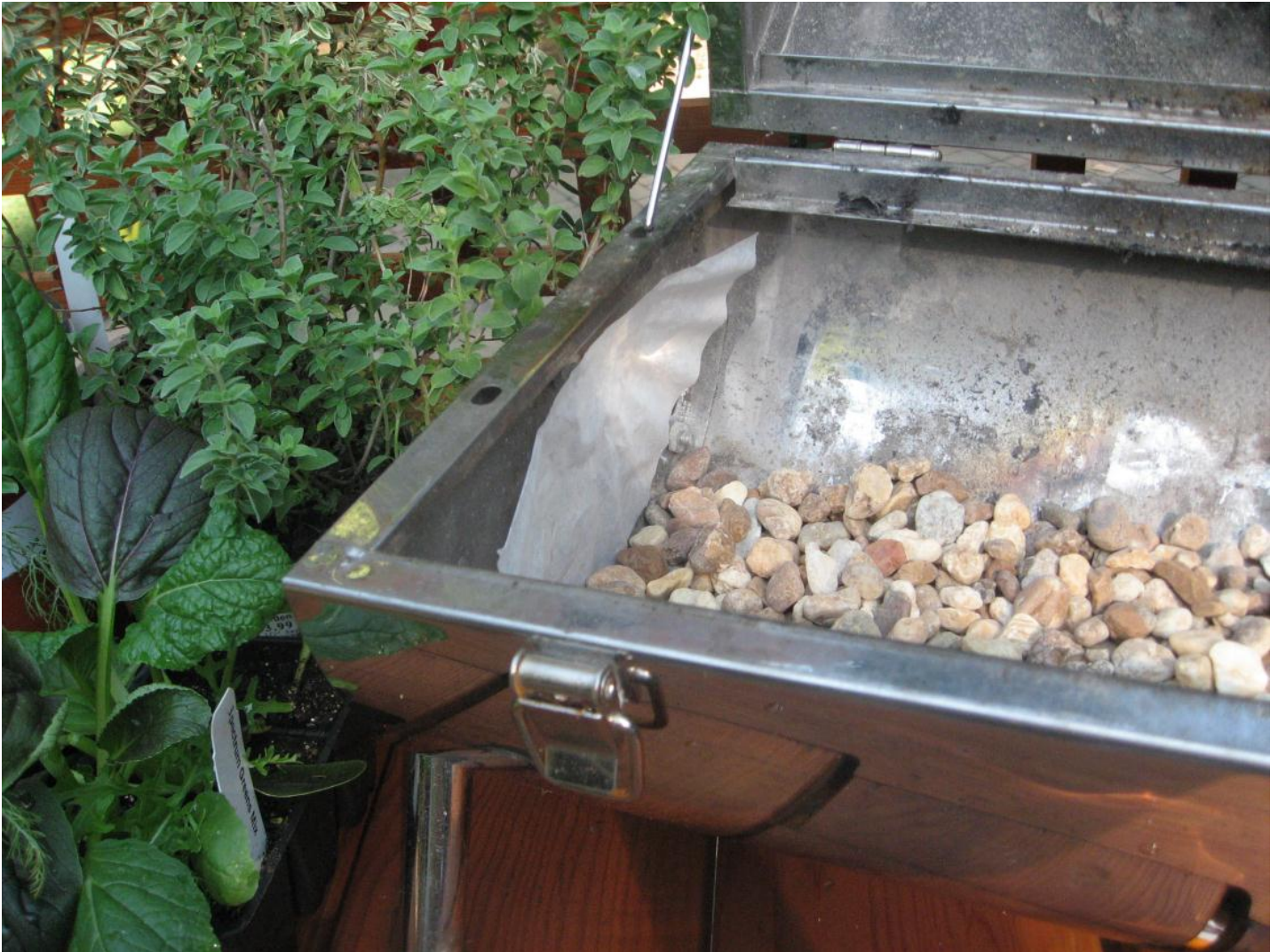
Use a coffee filter to cover large openings that will allow soil to spill out of container.