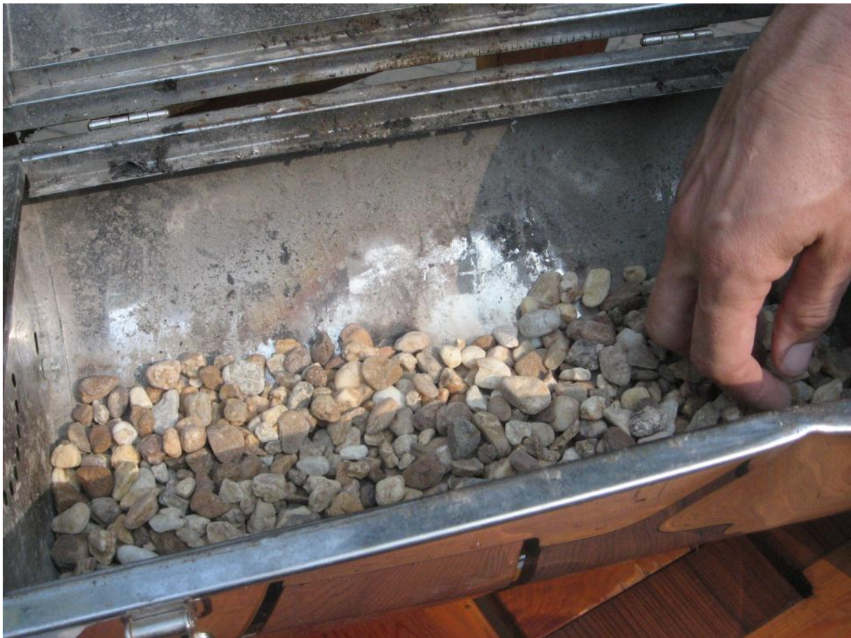
A few inches of clean gravel in the bottom of the container allows for better drainage in your container.